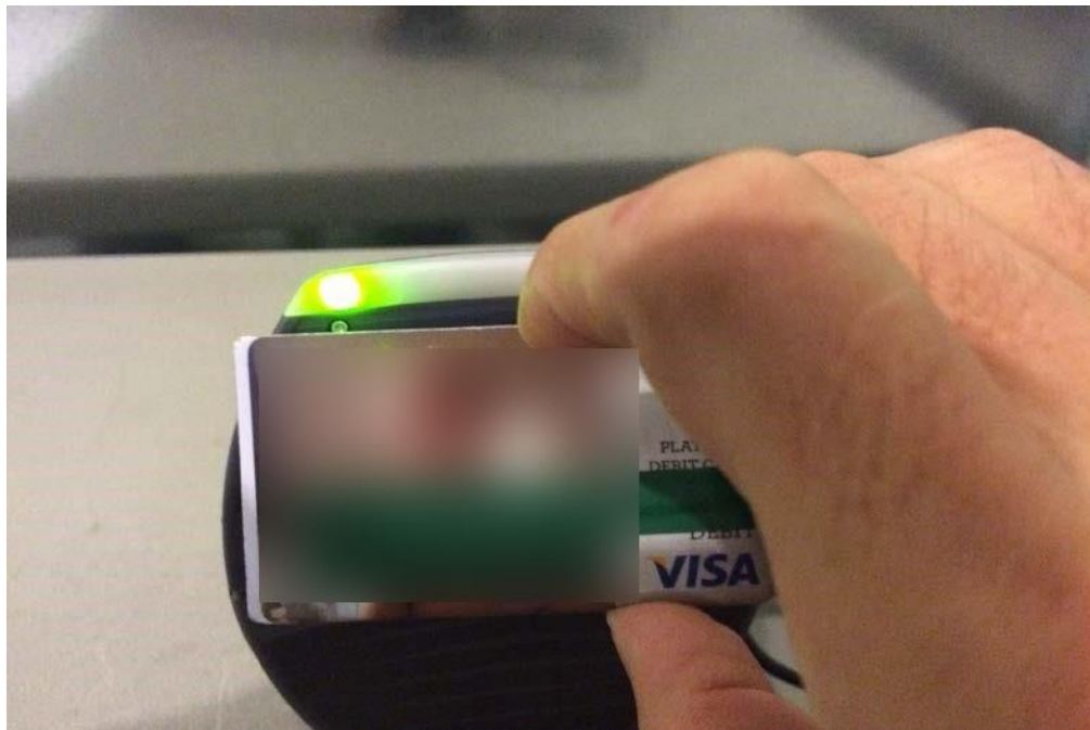
Figure 4: Step 2 (SignalVault V.2, Back Side Scan)