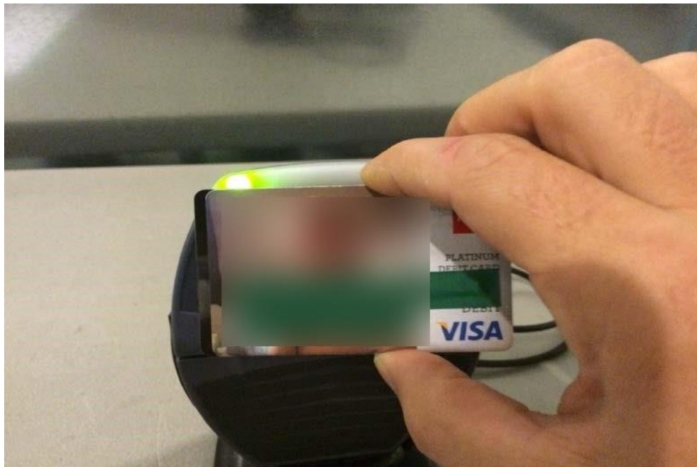
Figure 3: Step 2 (SignalVault V.1, Back Side Scan)