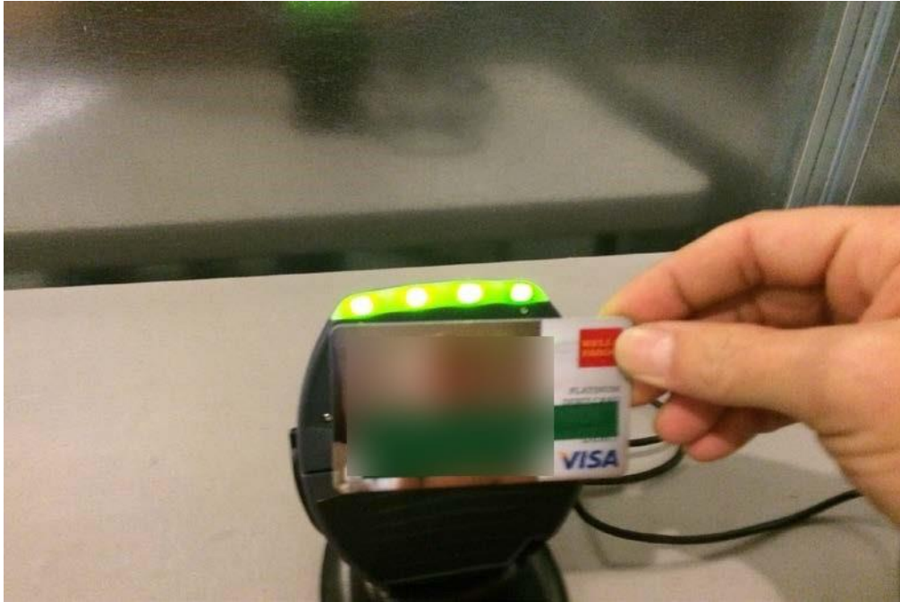
Figure 2: Step 1 (Card Reader, Verification of Proper RFID Operation)