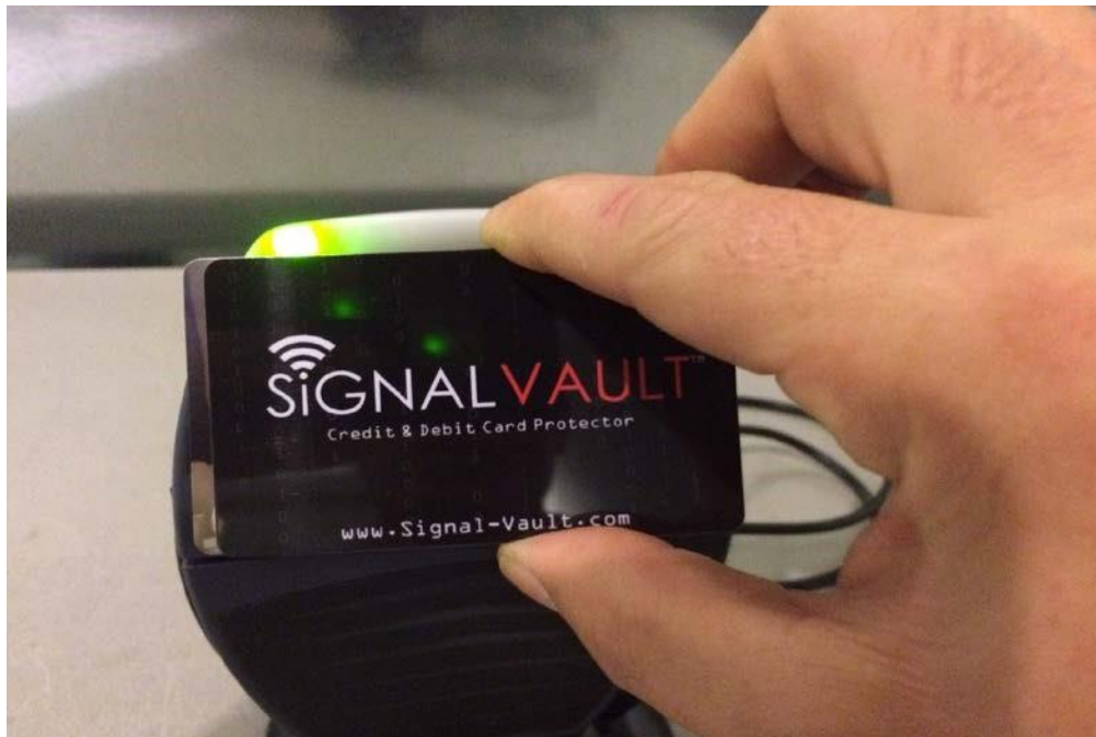
Figure 5: Step 2 (SignalVault V.1, Front Side Scan)