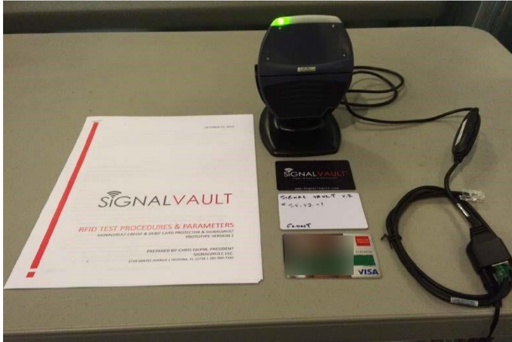
Figure 1: Overall Setup Photo